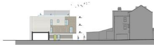
PROPOSED ELEVATION D