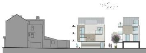
PROPOSED ELEVATION E