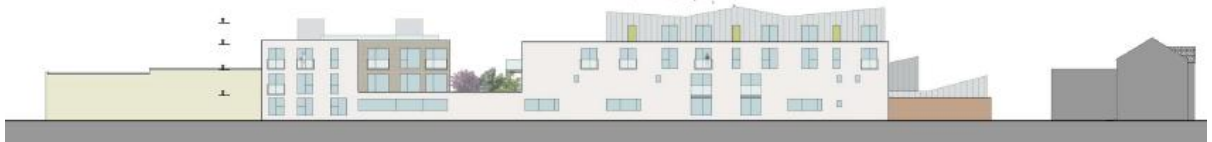
PROPOSED ELEVATION C