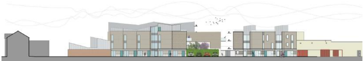
PROPOSED ELEVATION B