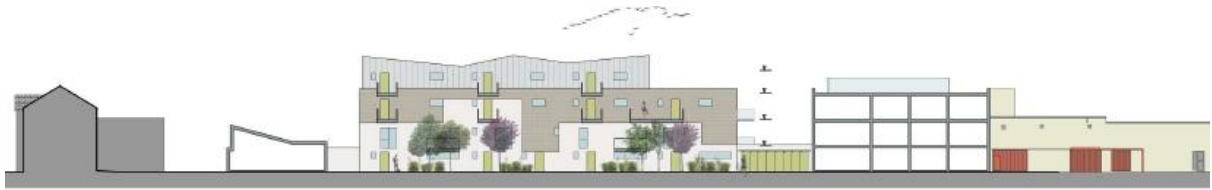
PROPOSED ELEVATION A