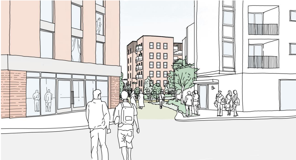
View Down Lordship Lane