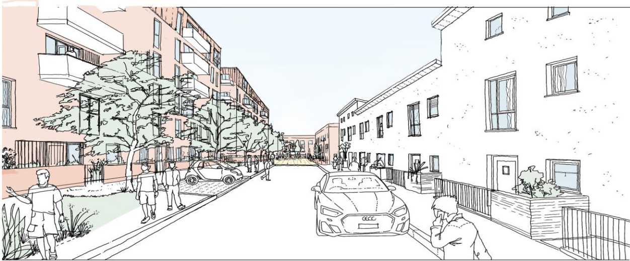
North South View from Lordship Lane