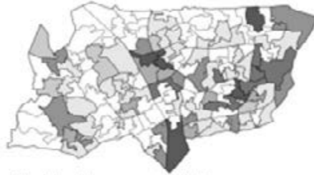
Bedded down contacts by area

Were seen sleeping rough in Haringey in 2021/22