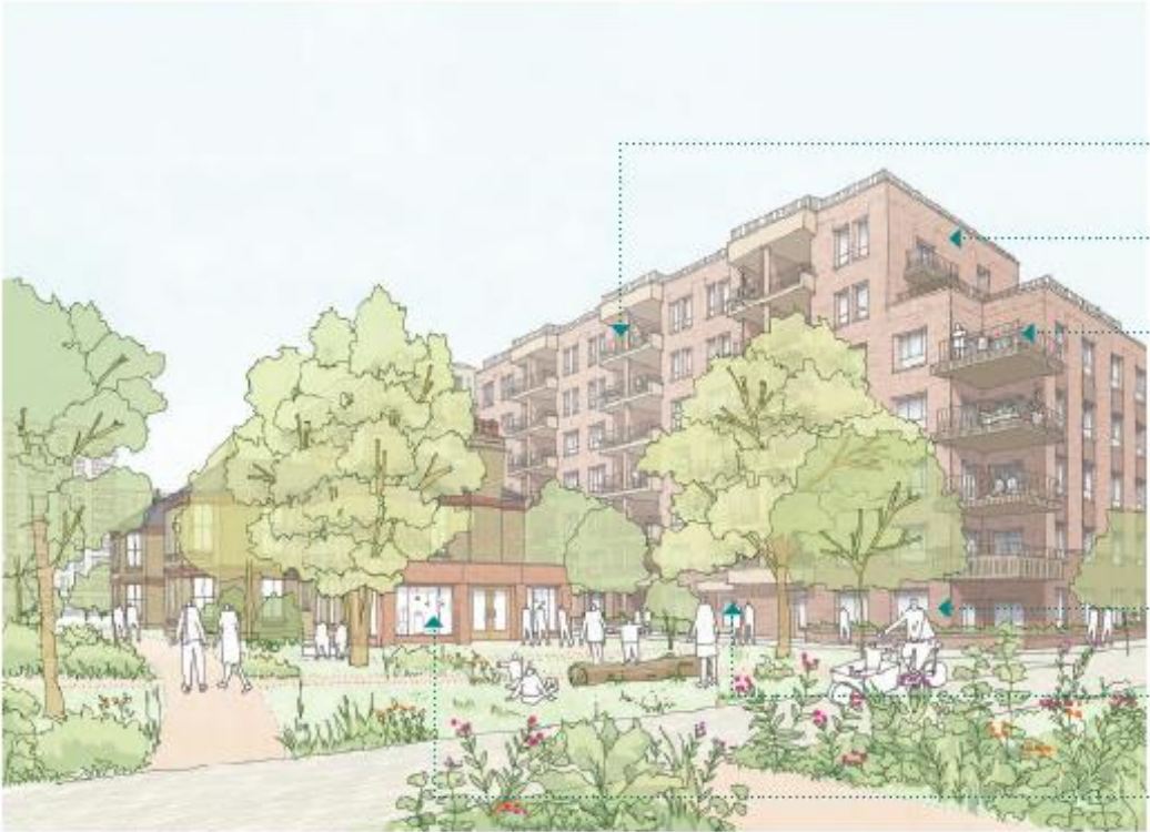
View of New Houses (Plot A) and Block C from St Ann's Road