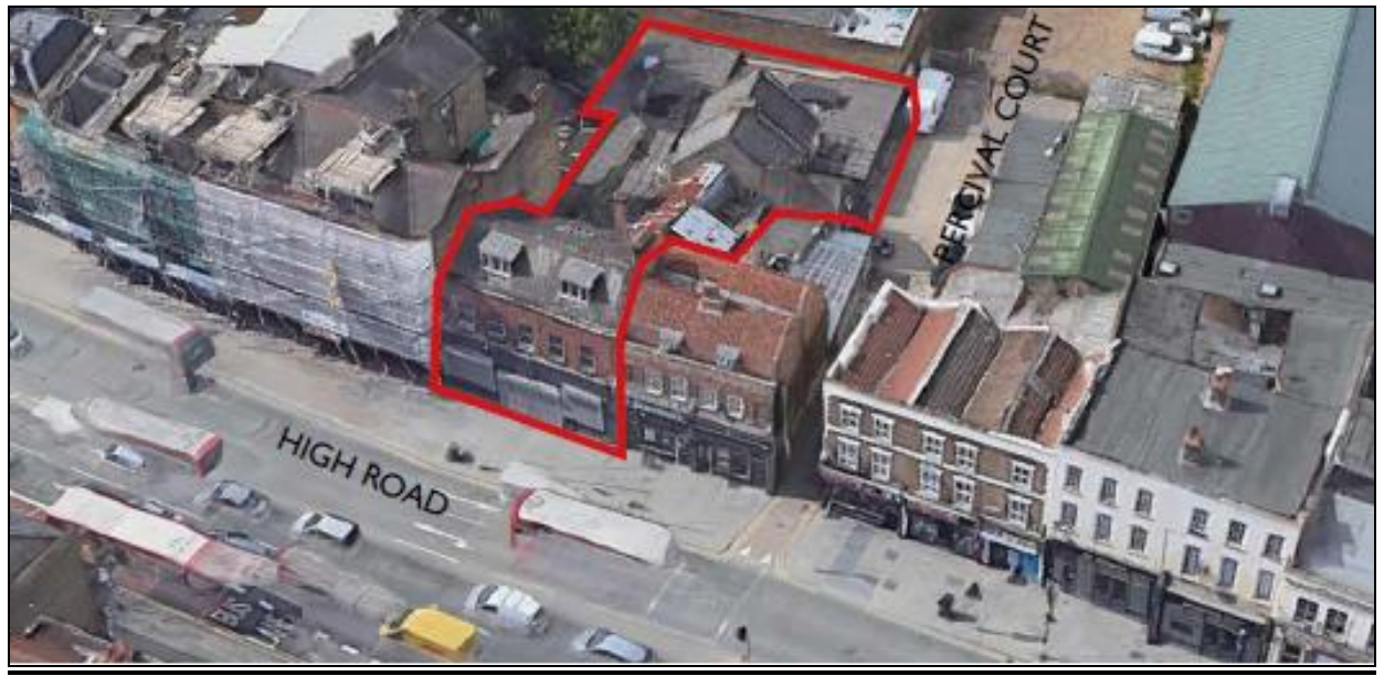
The site - No. 807 High Road