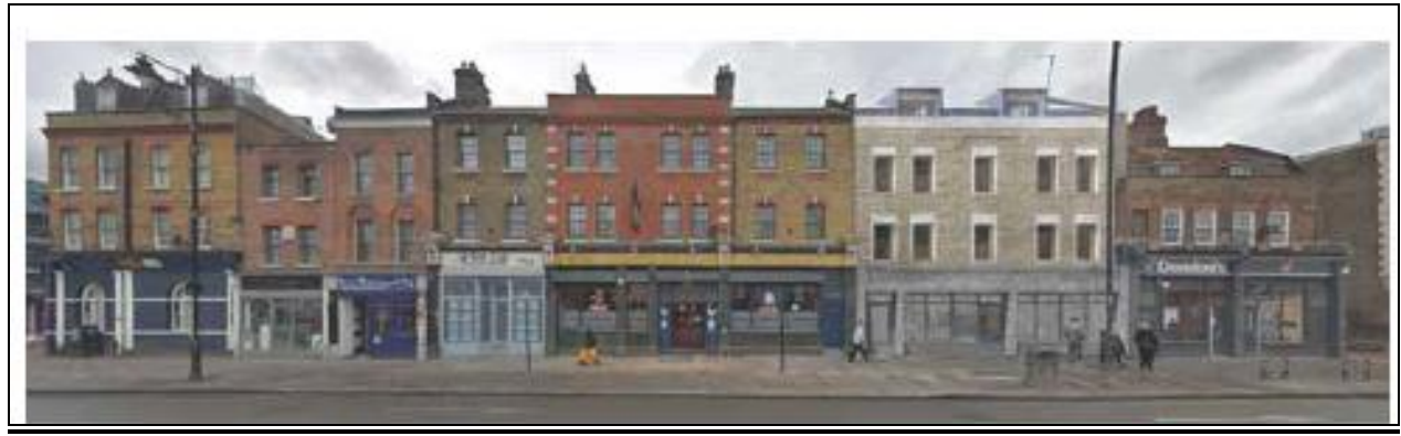
Proposed High Road elevation