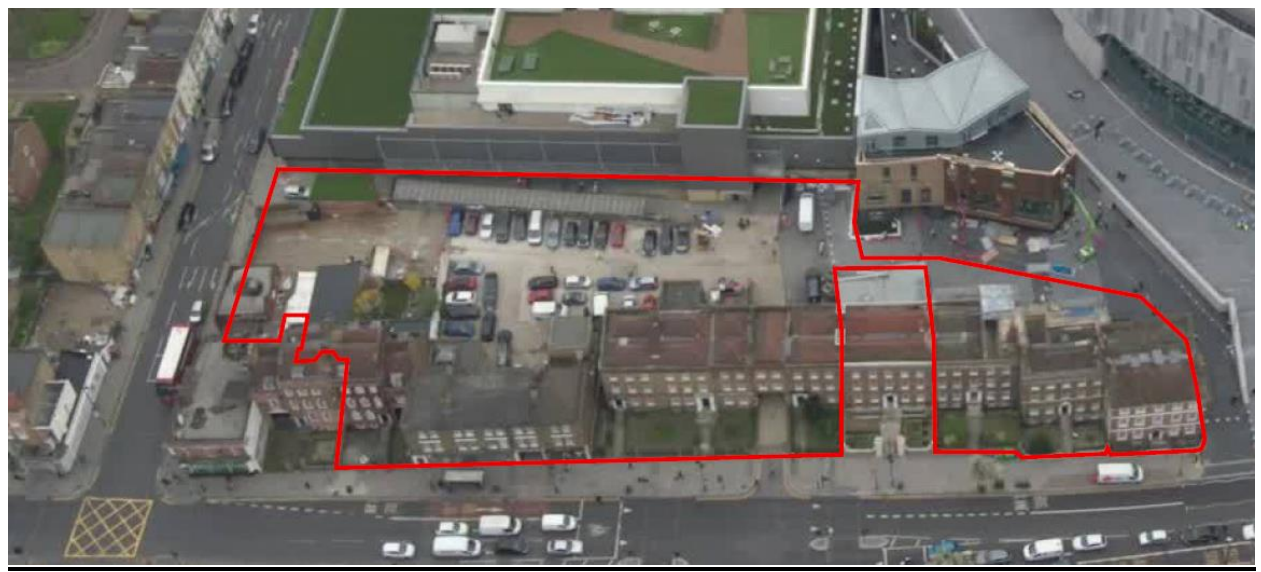
The Northumberland Terrace site - High Road properties & land at rear.