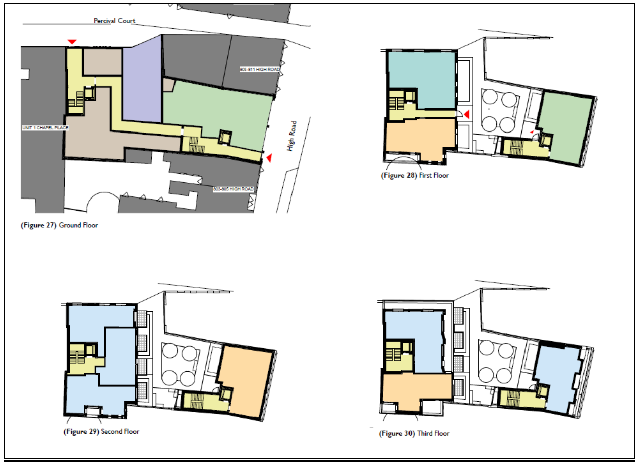
Proposed floor plans