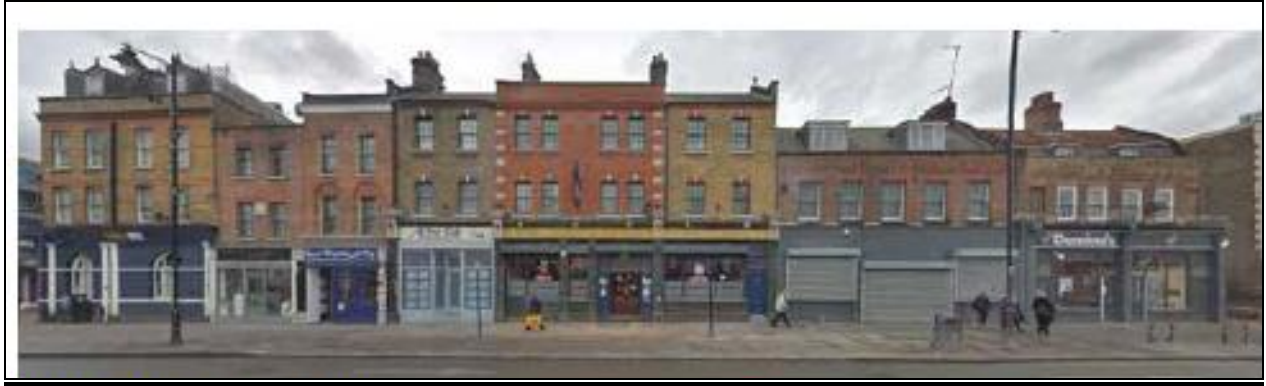
Existing High Road elevation