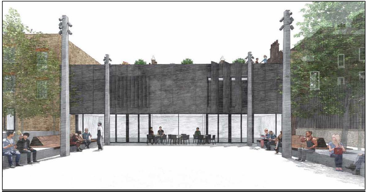
Extension to rear of Nos. 804-806 High Road (performance venue)