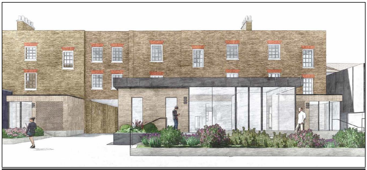
Extensions to the rear of Nos.798-802 High Road