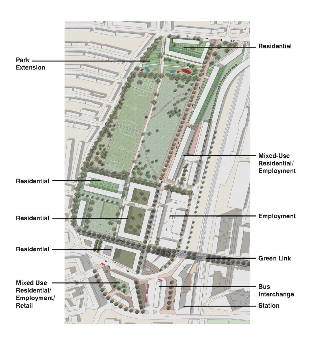
Plan 2 Greater Ashley Road - Indicative Development Proposals suggested in Consultants' Feasibility Study